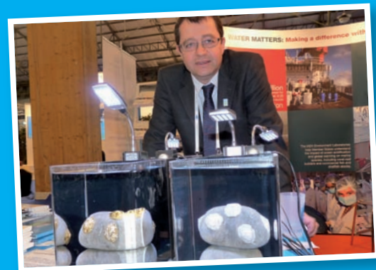
Turker Kurtas, Isotope Hydrologist at the Atomic Energy Agency explains: "The CO2 lowers the pH of the oceans". In 2100, the pH should increase from 8.1 to 7.8 impacting shellfish and habitat.