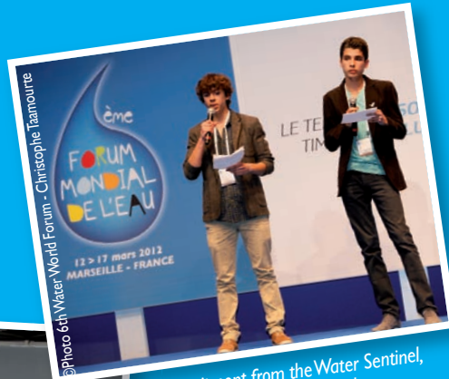
Commitment from the Water Sentinel, Marseille highschool