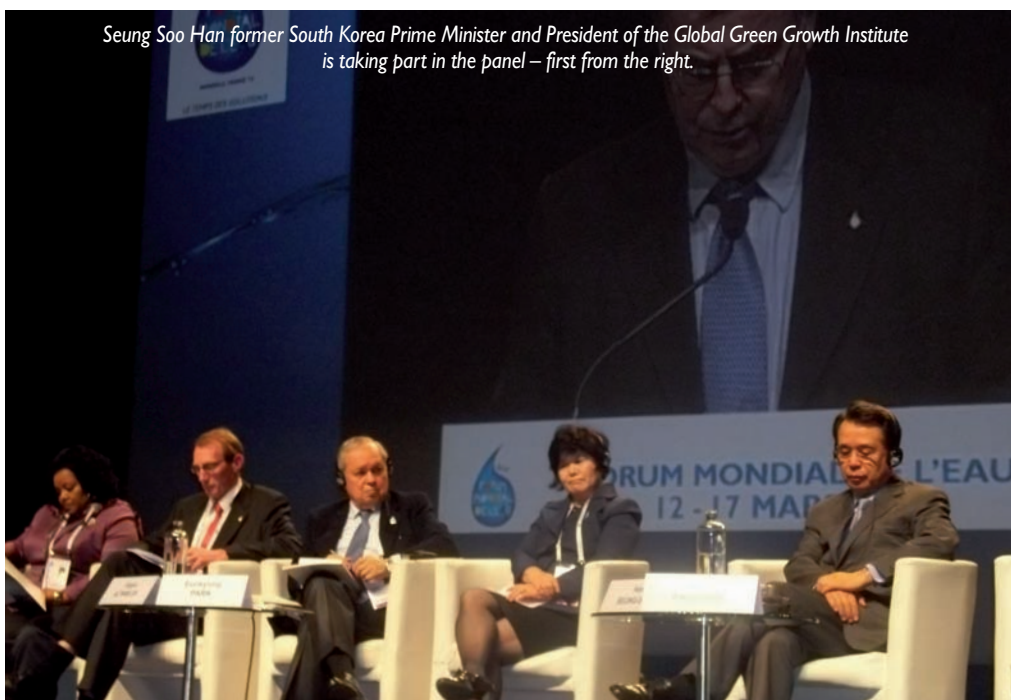
Seung Soo Han former South Korea Prime Minister and President of the Global Green Growth Institute is taking part in the panel – first from the right.

A policy framework supported by twenty-six case studies introducing best practices in terms of green growth are unveiled by a group of international experts. This presentation is the beginning of the work of this group which unites high level actors on the place of water in this new form of development.