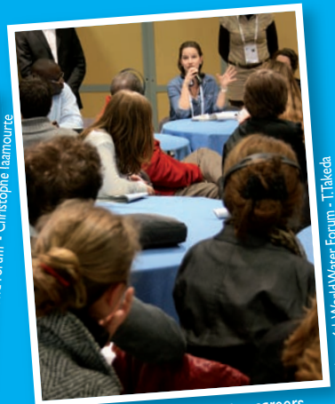
Discussion regarding water careers in basic services by Réseau Projection