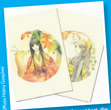
A Little Ms. Sea postcard to support the tsunami-hit region of Japan.