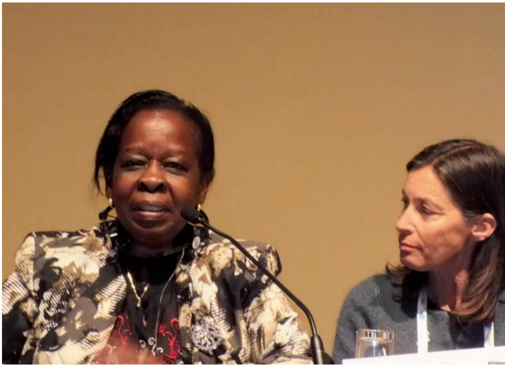
Like the other speakers, Maria Mutagamba, Minister for Environment and Water of Uganda, calls for gender-sensitive policies.

The room was full at the high level session on women's leadership in the water sector at the 6th World Water Forum, on 14 March. High level speakers and participants agree: women are the key to solving issues linked with water and sanitation.