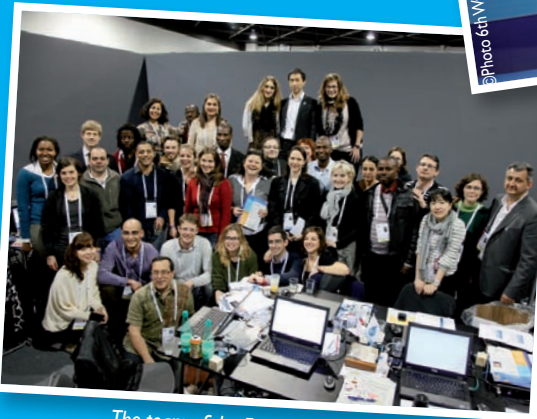
The team of the Forum Gazette, journalists and young professionals from the Projection Network.