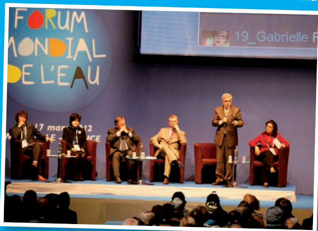
Bart Devos, President of the World Youth Parliament for Water, E.K. Park, President of the Forum regional commission, Loïc Fauchon, President of the World Water Council, Ben Braga, President of the 6th World Water Forum, Henri de Raincourt, French Minister in charge of Cooperation, and Martine Vassal, Vice Mayor of Marseille.