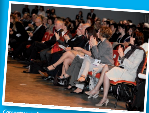
Commitments for water appraised by the international Forum community.