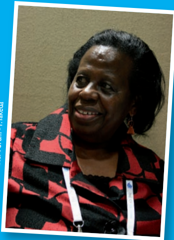
Ms Rejoice Mabudafhasi (Deputy Minister, Ministry of Water and Environmental Affairs, South Africa), for African Youth and Gender Solutions on Water and Sanitation.